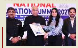
Excellence in Academic & Research Innovation* at Education Summit ASSOCHAM