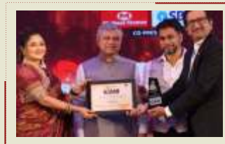
CMD, The Sage Group with Shri. Ashwani Vaishnav, Minister of Railways, Govt. of India.

“Transforming your Passion into Profession”