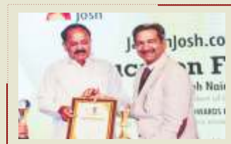
Top Private University in Central India Award by Vice President Venkaiah Naidu